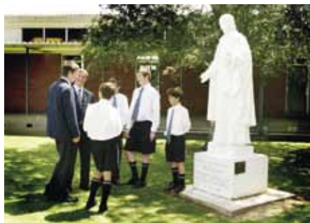
The Marist Brothers, guided by the charisma of St Marcellin Champagnat, built the first buildings of SHC in 1903. In this next phase of development, we continue to honour their faith and hope.

The development will bring to life the Auditorium and the Great Hall, which enables our entire community to come together. With seating for 1500, and a large reception area, the intention is to accommodate formal and social occasions. There will also be space for a Hall of Memories, where the treasures of the past can be properly displayed for all to enjoy.