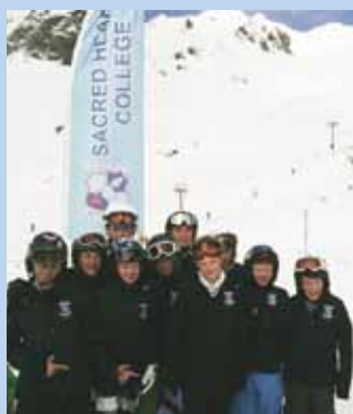
Our skiers fly the flag for SHC at Mt Ruapehu.

At the time of going to print, the Year 9