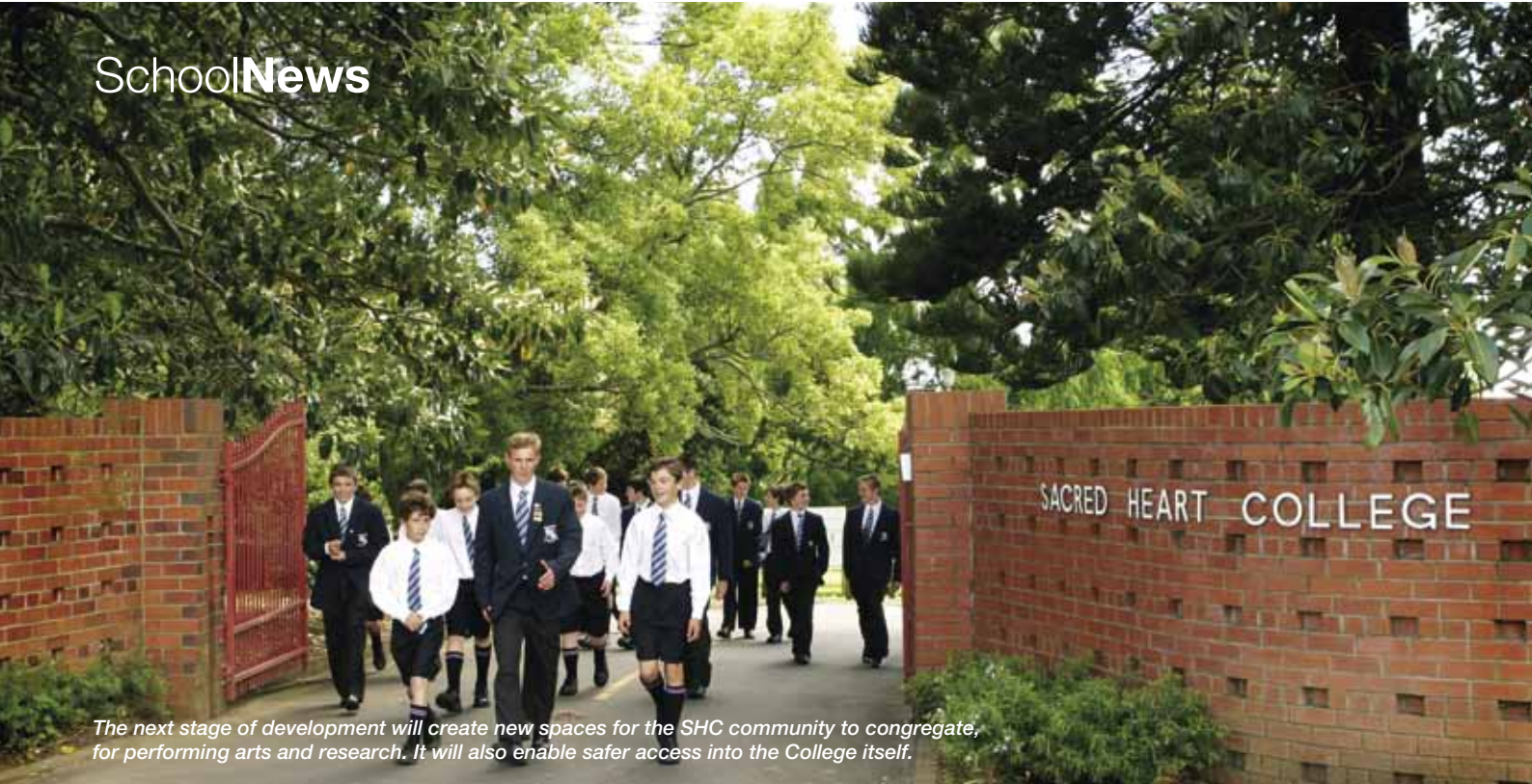
The next stage of development will create new spaces for the SHC community to congregate, for performing arts and research. It will also enable safer access into the College itself.